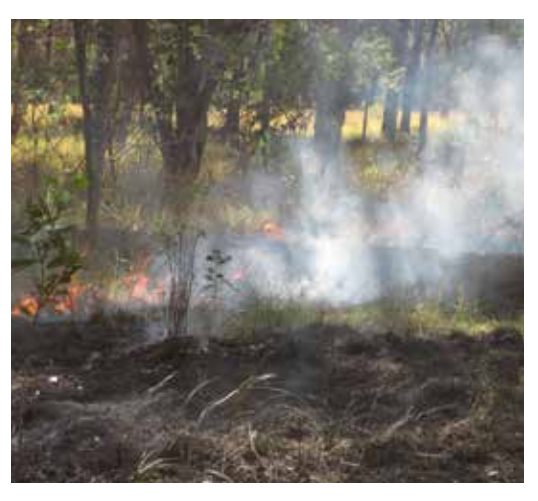
Low intensity fire. \ensuremath{\mathbb{Q}} W. Parker.