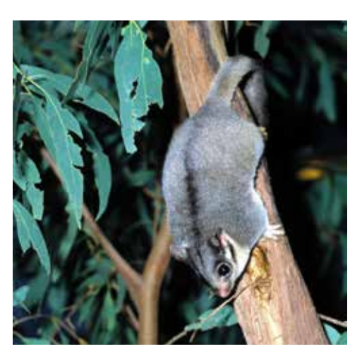
Squirrel Glider