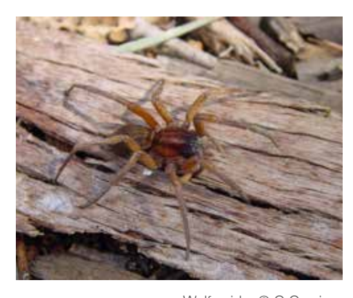
Wolf spider