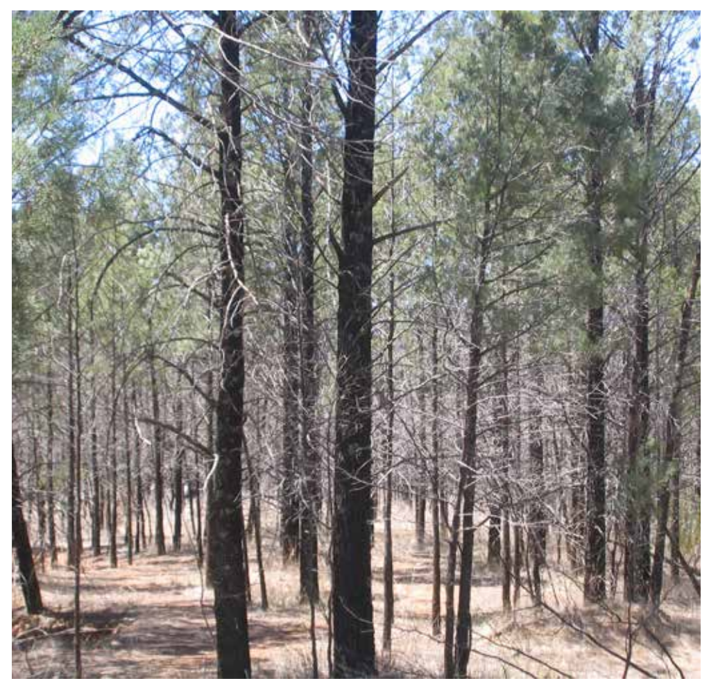
White cypress pine.

While fire may open up cypress pine stands, managing the intensity and spread of fire can be challenging. The trick will be to find fire regimes that balance all the different needs of plants, animals and us – a job for landholders, people familiar with fire and scientists to tackle together.