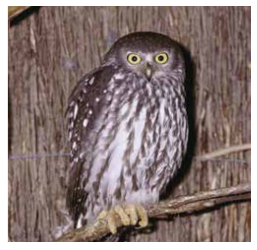
Barking Owl

There are significant areas of mature and old growth eucalypt forest in the mountainous landscapes of the Murrumbidgee catchment. These magnificent forests have numerous hollows and provide habitat for an abundance of fauna. Many fauna species are dependent upon hollows for key parts of their life-cycle. Specifically, hollows provide places for animals to feed, shelter and breed. Hollows can take many centuries to develop or be replaced when lost from a landscape. Fires can burn through significant hollow-bearing trees and cause them to fall. This leads to a loss of valuable habitat and causes increased competition for remaining hollows. Maintenance of hollow-bearing trees and enhancement of these valuable habitats wherever possible, is needed to ensure the survival of many native species.