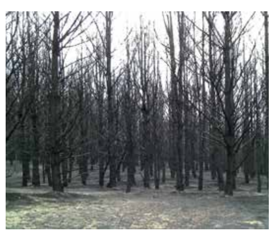
Extensively burnt areas can affect the ability of plants and animals to recover after fire. © M.Graham, Hotspots Fire Project.

Fire frequency, extent, and intensity are naturally patterned across a landscape, particularly in mountainous and hilly country. This is determined largely by weather, aspect, slope and vegetation type. Fire management therefore both respond to and make use of these patterns. For example, gullies often contain more moisture loving plant species than upper slopes and ridges. Unplanned fires are less likely to burn into gullies, since the gullies are naturally wetter; and species in gullies are more likely to be adapted to less frequent fire than species growing on higher ground. A fire management plan should account for this.