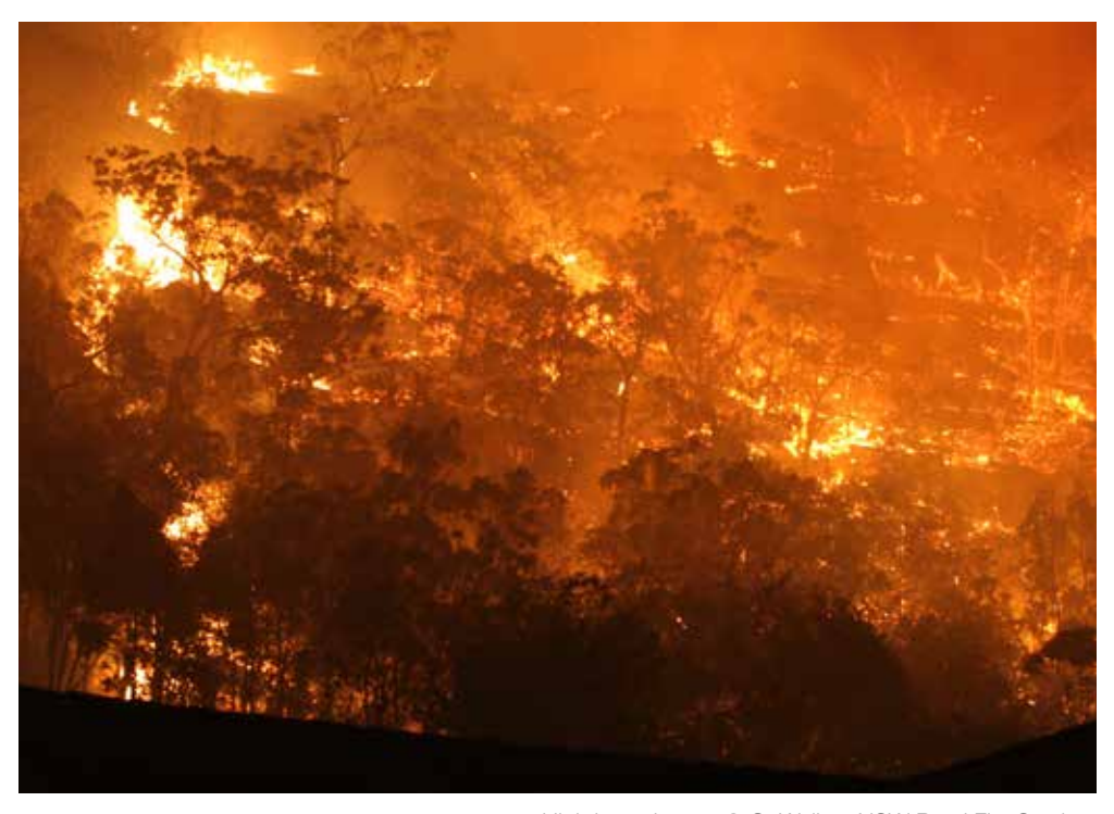
High intensity fire.

Biodiversity is more likely to be sustained when fire management extremes are avoided. Excluding all fire from your property, or burning as soon as vegetation has sufficient fuel to support a fire, will eventually see the loss of species adapted to a more moderate or variable regime.