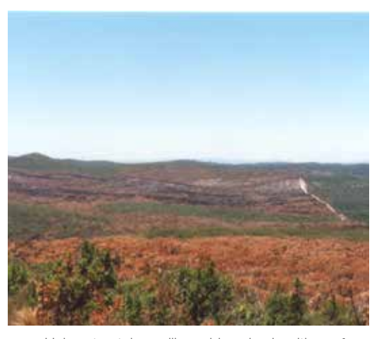
Unburnt patches will provide animals with a refuge during and after the fire.