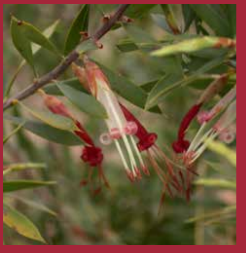
Obligate seeder pink five-corners (Styphelia triflora)

On the other hand, if fire is excluded from an area for too long, a whole generation of obligate seeders may move beyond reproductive age and die off before a fire has had a chance to trigger germination. While some seeds can survive in the soil for very long periods, seeds of some species are relatively short lived.